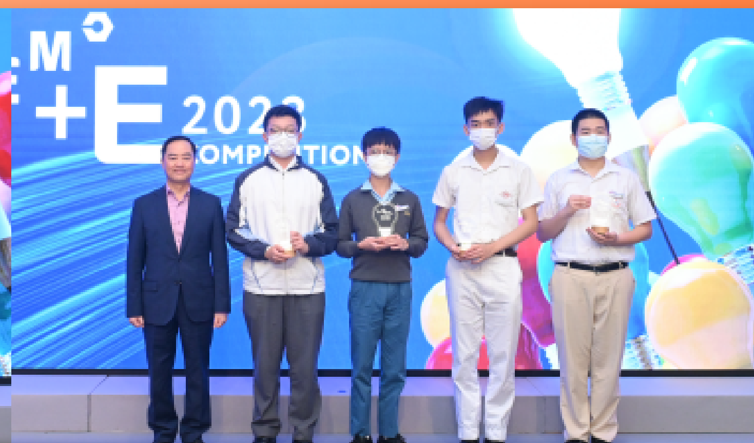
WINNER, VENTURE TRACK Group VIA: Cool Shield

THANK YOU STUDENTS FOR THE INSPIRING PITCHES!