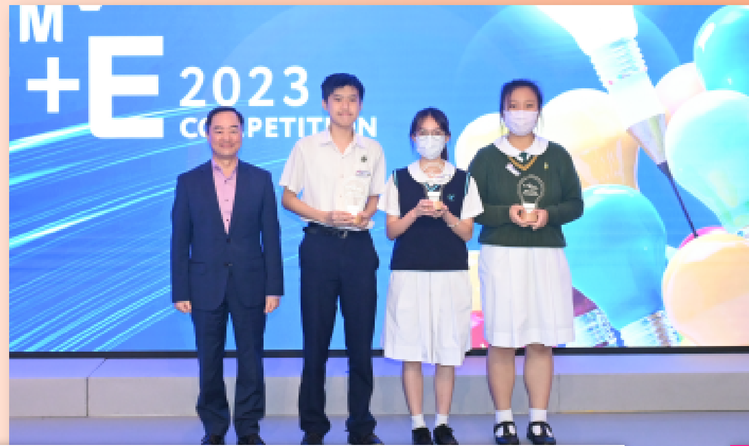
CHAMPION, ENTREPRENEURSHIP TRACK Group 14D : 高球隨意門