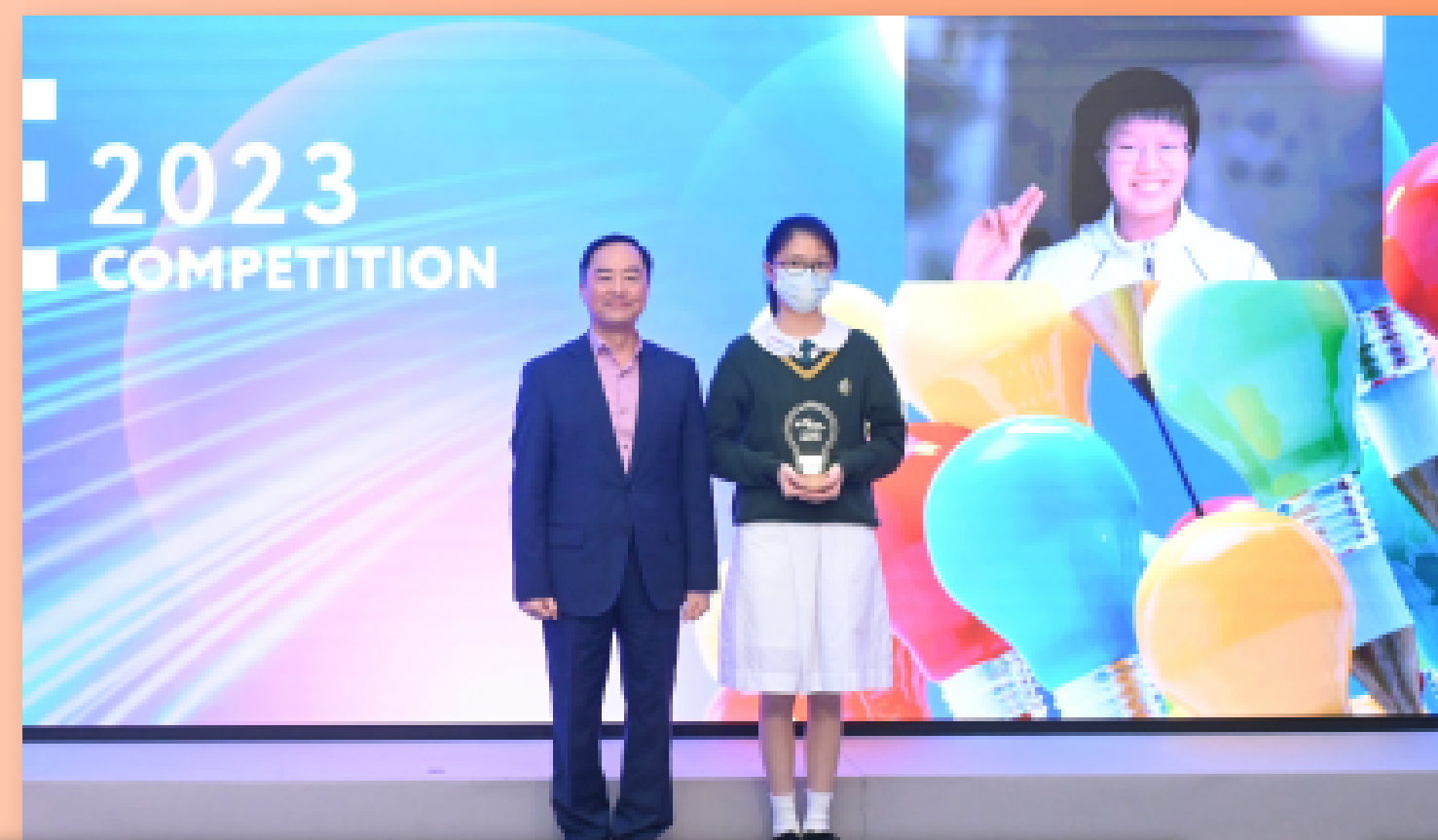
WINNER, REGIONAL TRACK Group RID : 切叶蜂