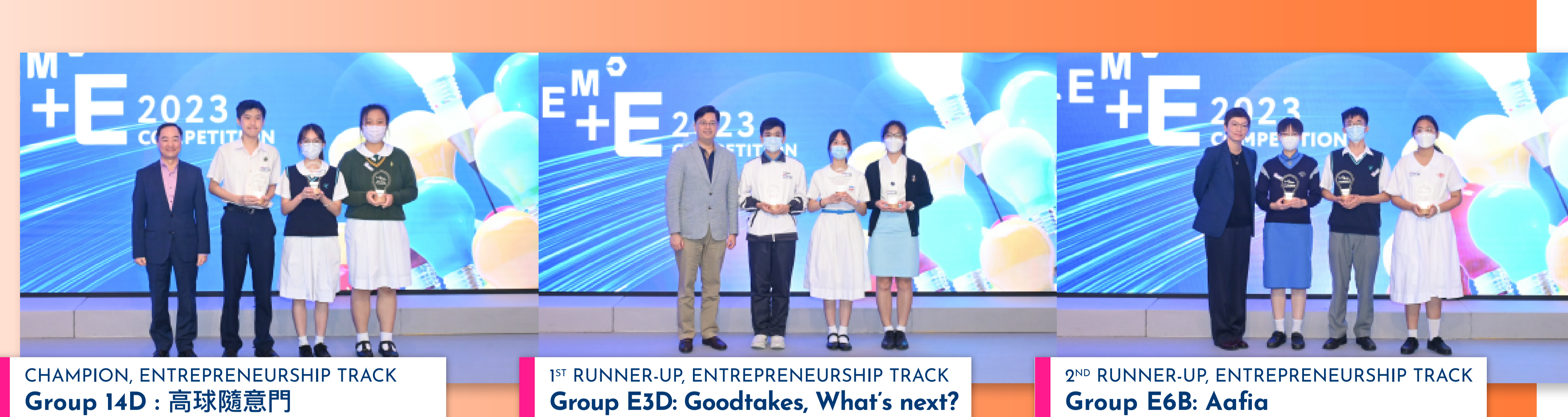
CHAMPION, ENTREPRENEURSHIP TRACK Group 14D: 高球隨意門 1 st RUNNER-UP, ENTREPRENEURSHIP TRACK Group E3D: Goodtakes, What's next? 2 nd RUNNER-UP, ENTREPRENEURSHIP TRACK Group E6B: Aafia

Congratulations to the 5 winning teams from 81 groups!