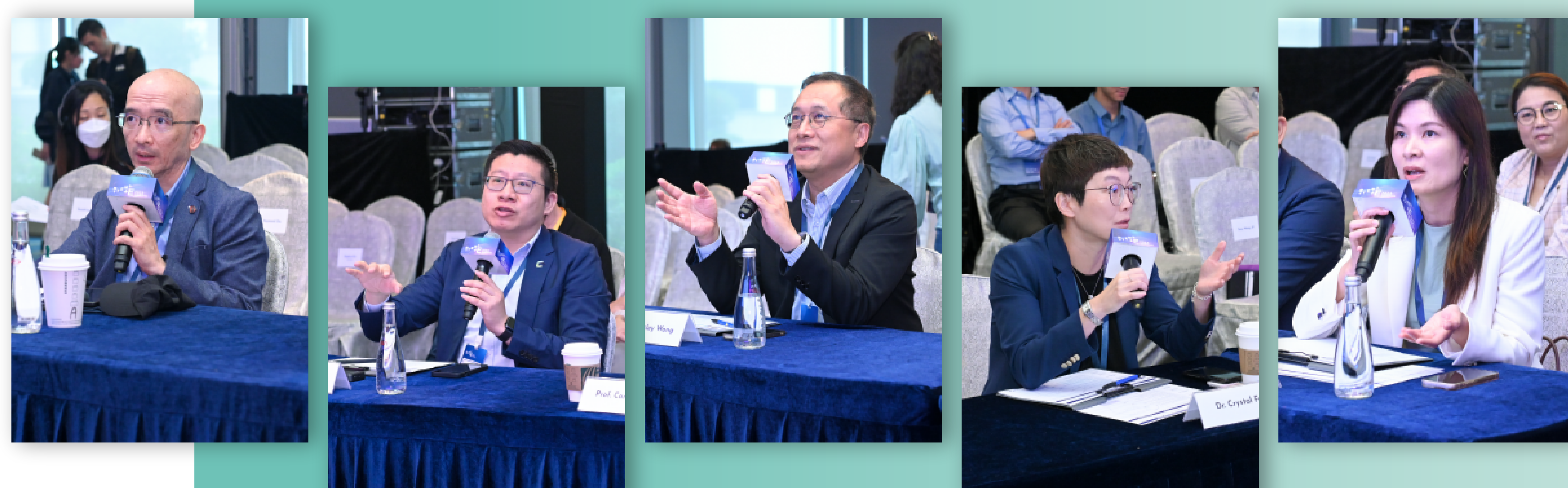
The judging panel comprises of entrepreneurs, investors, innovators and academics

Congratulations to the 5 winning teams from 81 groups!