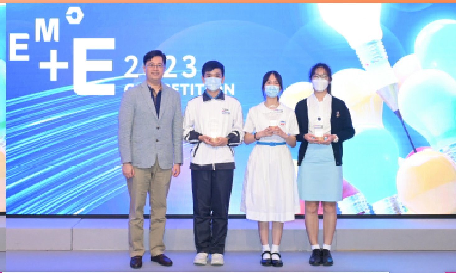
1 ST RUNNER-UP, ENTREPRENEURSHIP TRACK Group E3D: Goodtakes, What's next?