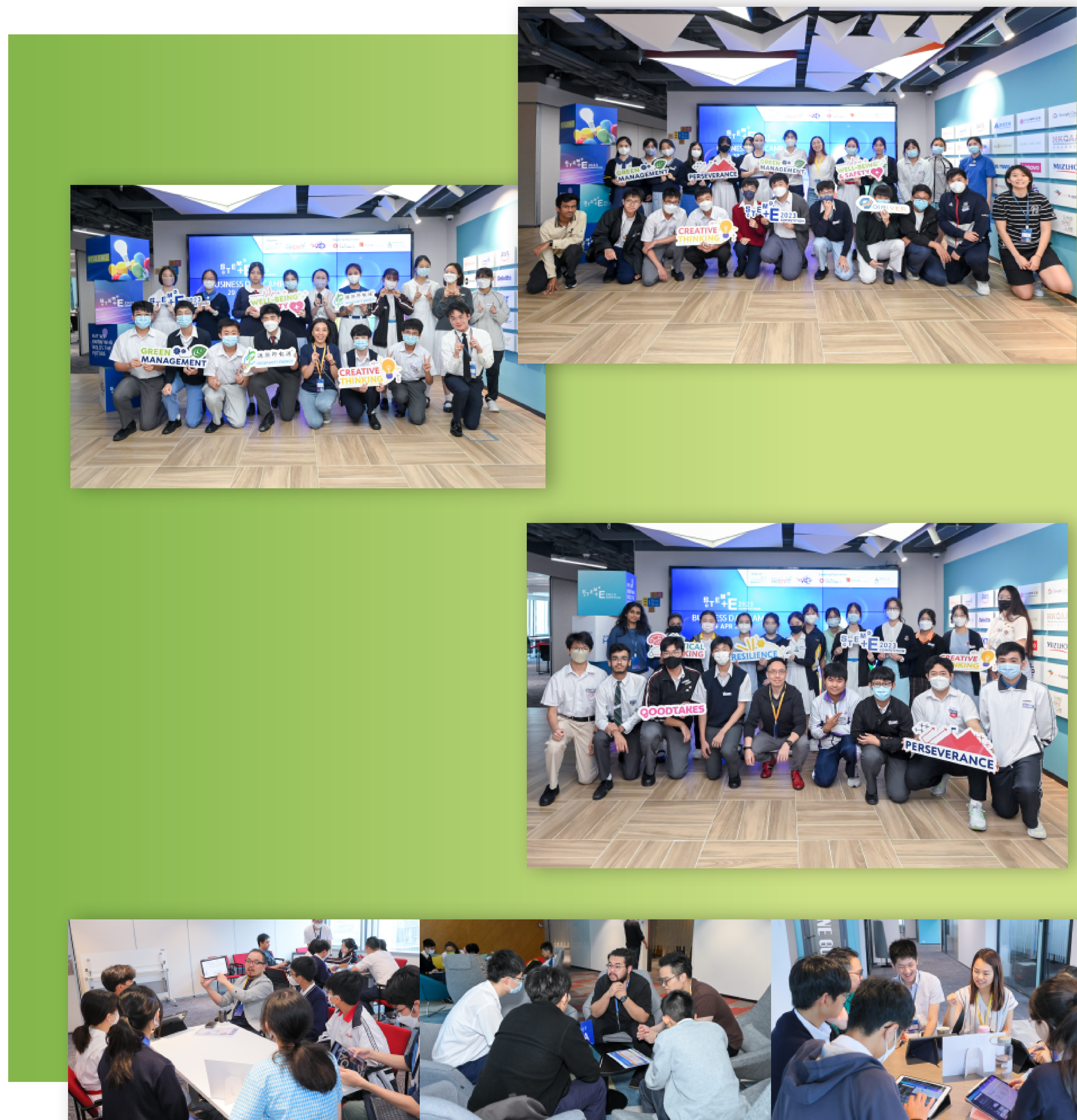
Final Sprint on the Presentation Deck with Instant Feedback from Business Coaches