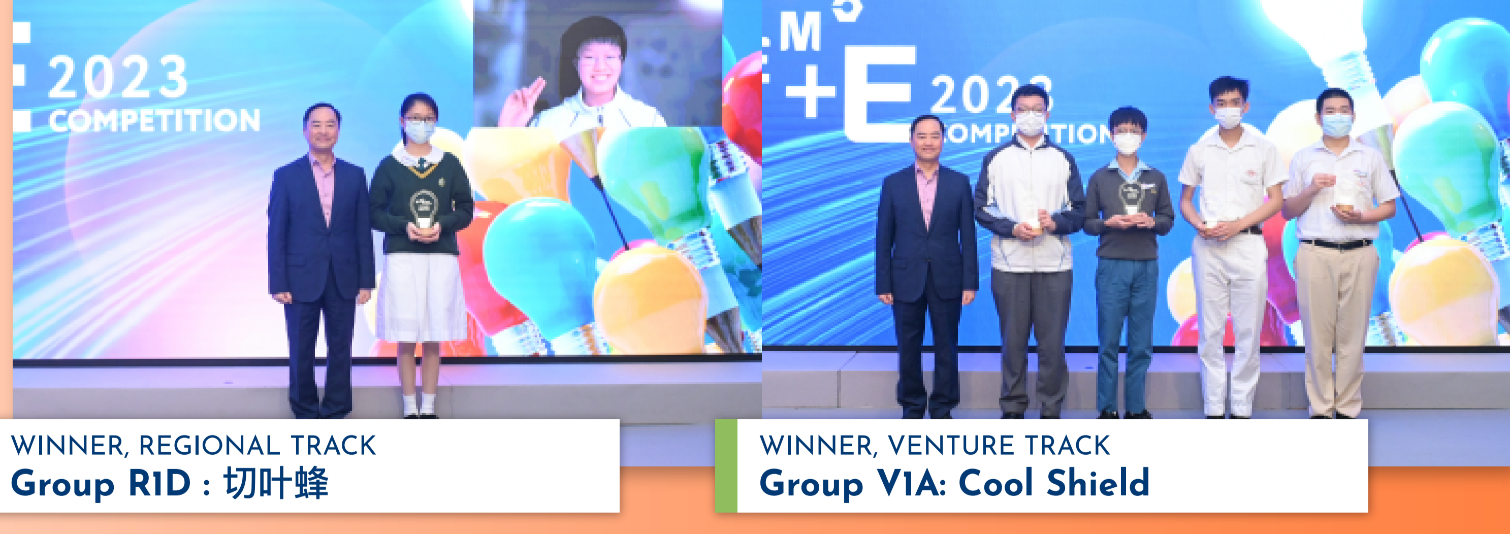
WINNER, REGIONAL TRACK Group RID: 切叶蜂 WINNER, VENTURE TRACK Group VIA: Cool Shield

THANK YOU STUDENTS FOR THE INSPIRING PITCHES!